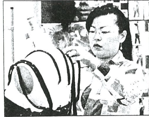
FT student drapes a mannequin.

PROGRAM DESCRIPTION: The curriculum is designed to provide competency for a wide range of occupations in the fashion industry. Theoretical knowledge and practical skills are applied in clothing construction, industrial sewing, flat patternmaking, designing, textiles, fashion sketching, grading, marking and cutting, and computerized grading and marking. Internship or cooperative education experiences are available to interested students. This broad background enables students to select various occupations such as designer, patternmaker, cutter, or custom dressmaker.