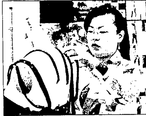
FT student drapes a mannequin.